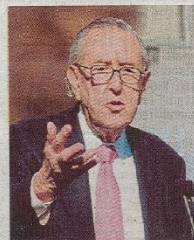
The late César Pelli

dome with an integrated pinnacle atop the towers — successfully reaching 452m tall, surpassing the Sears Tower.