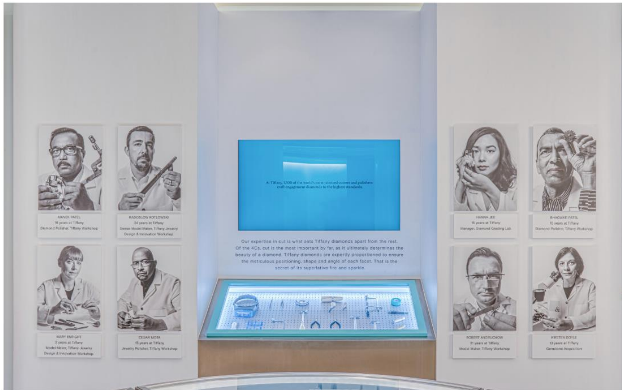
A recreation of the Tiffany workshop in New York

In this recreation of the Tiffany Workshop in New York City, guests can meet the team of highly-trained craftspeople—from the diamond polishers to the model makers—and the tools they use to meticulously cut each stone to achieve maximum beauty and brilliance. It is a captivating exploration of the American jewellery house's unrivalled artisanal legacy.