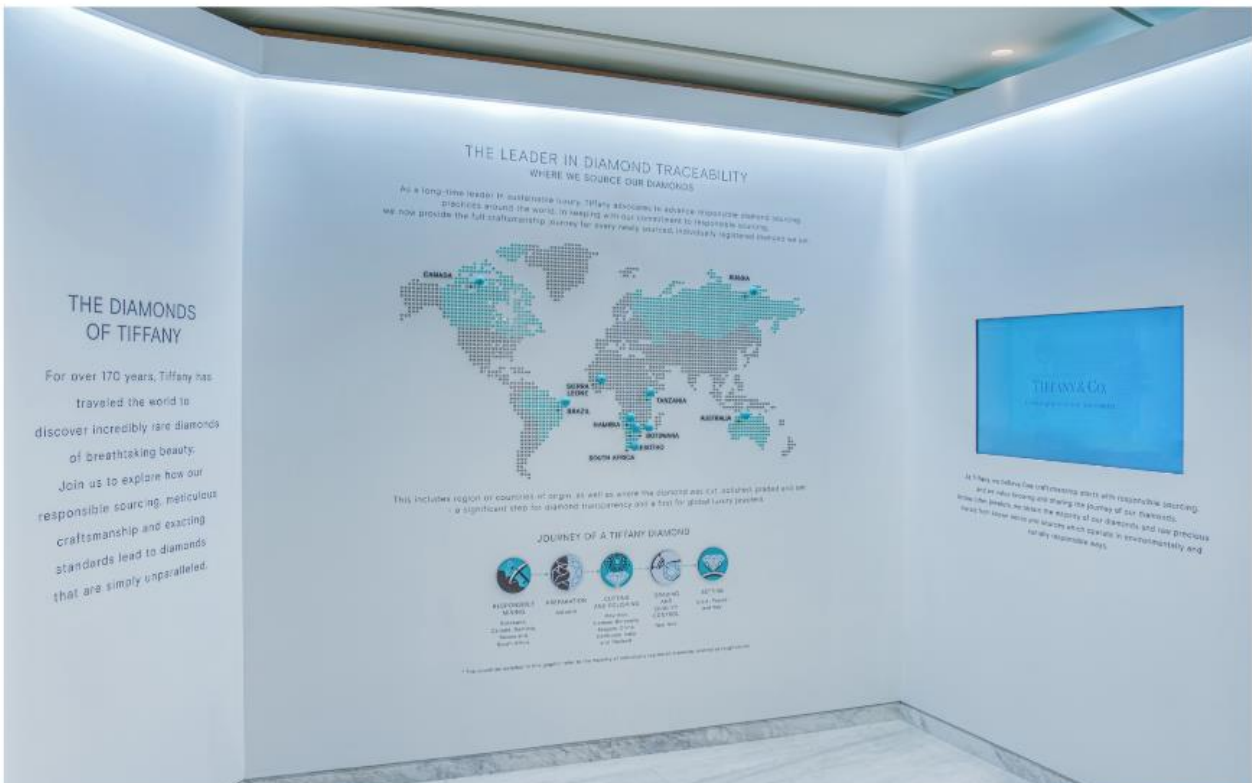
Tiffany & Co. are leaders in diamond traceability

Tiffany & Co. is committed to responsible sourcing and how it is an industry leader in diamond traceability. You can find out the full craftsmanship journey of each individually-registered Tiffany diamond, including the region and country of origin.