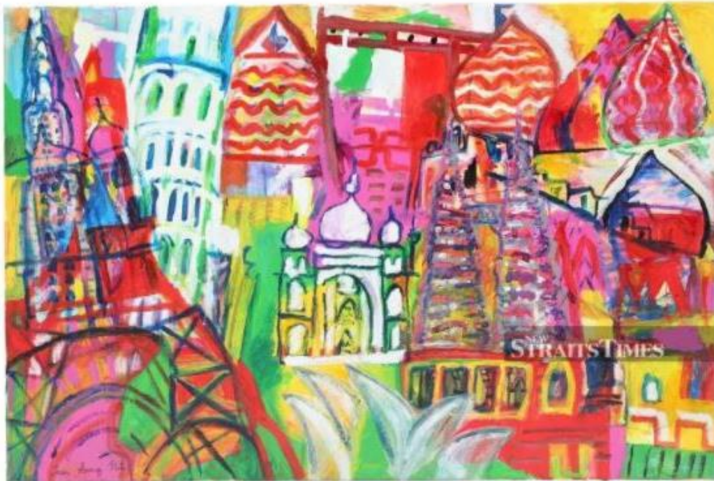
One of the artworks at the showcase.

IN celebration of United Voice's 25th anniversary, the Mandarin Oriental, Kuala Lumpur will be presenting United Voice Art Gallery from Oct 1-4.