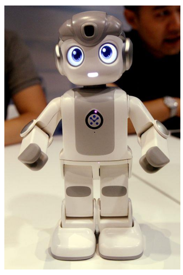
The Alpha mini, one of the latest products of Ubtech, will be showcased at the festival this weekend.

Visitors can also take pictures under the neon green ribbon roof, artfully arranged for that Insta-worthy effect, and is said to glow at night when the lights are directed at a certain angle.