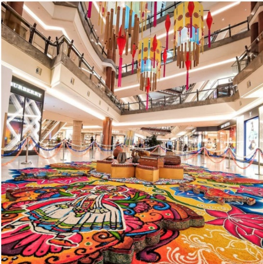
The Gardens Mall pulled out all the stops with an intricately designed kolam featuring Indian classical dancers.