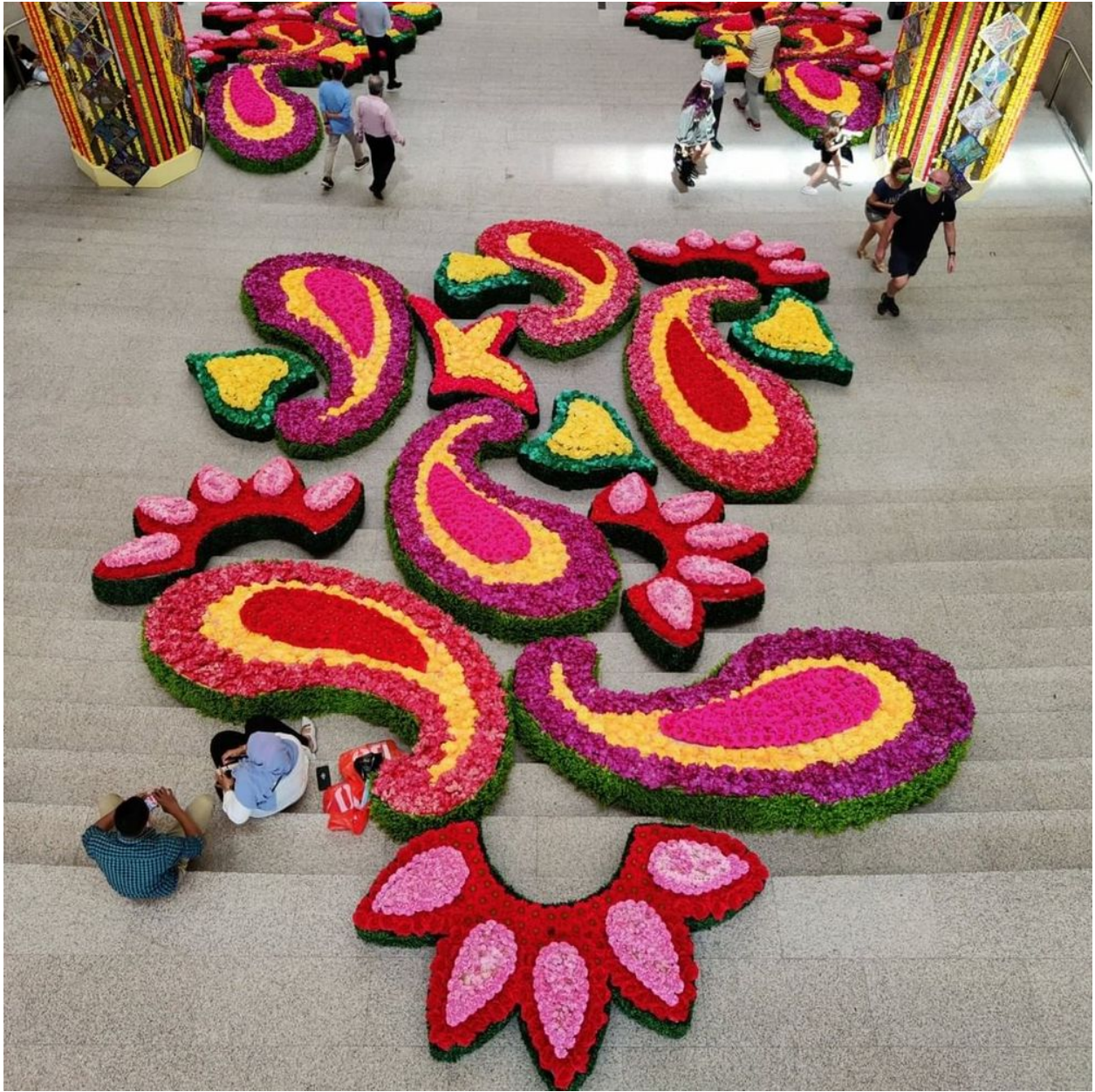
Instagram-worthy flower kolam at Pavilion Kuala Lumpur's Spanish Steps.