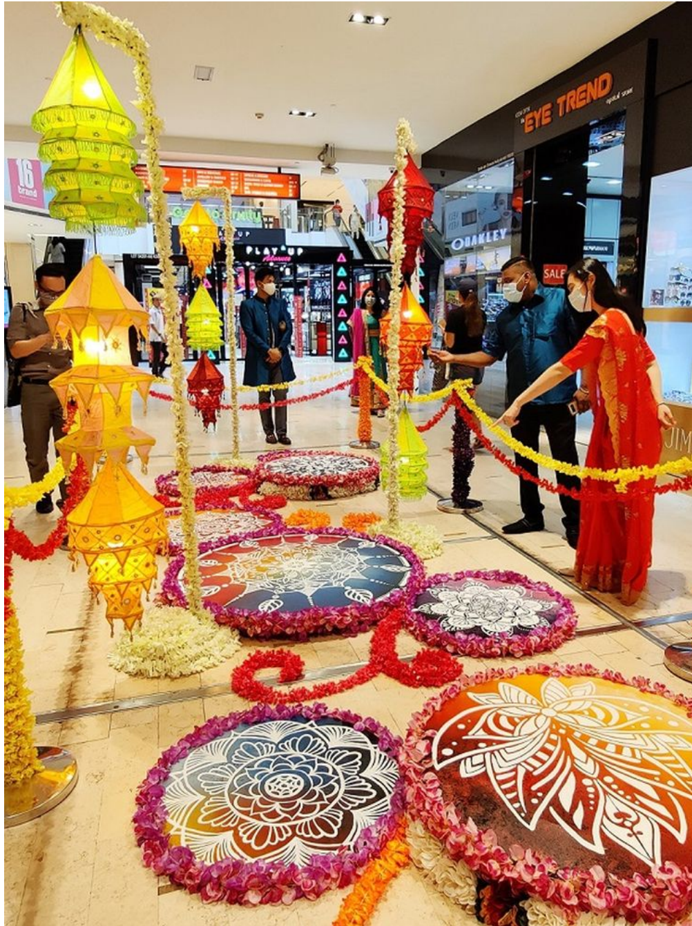
Fahrenheit88's colourful spray paint kolam.