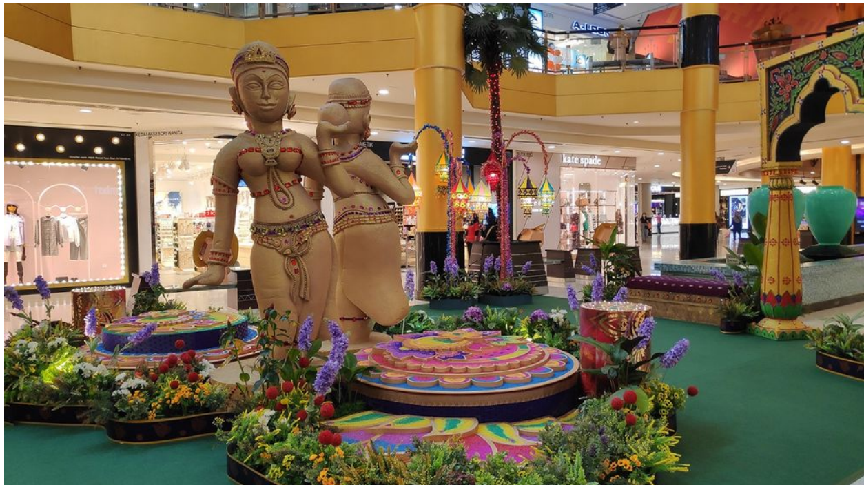
Sunway Pyramid prides itself with using upcycled decorations from previous materials.

Many operators say it's an important tradition to continue despite the extraordinary times we live in as a way of spreading cheer to patrons and those working in malls.