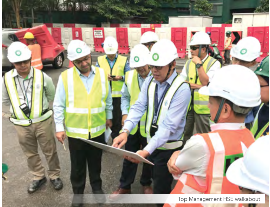
Top Management HSE walkabout

MOKL Hotel successfully received ISO 14001:2015, ISO 22000:2005 and OHSAS 18001:2007 certification (renewal) in September 2018 by SIRIM