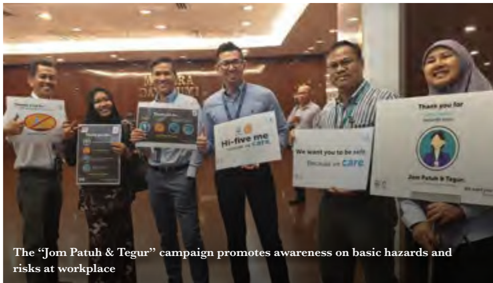
The “Jom Patuh & Tegur” campaign promotes awareness on basic hazards and risks at workplace

“ We place utmost priority in workplace health, safety and security and scale up towards a HSSE Generative Culture ”