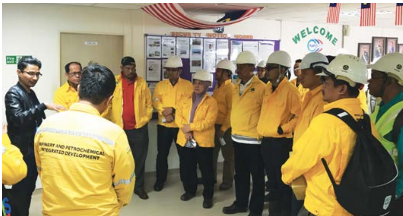
↑ KLCCP Stapled Group's HSE team participated in a HSE visit to a project site

KLCCP Stapled Group have the responsibilities in providing a safe workplace and healthy working environment for its employees. Ergonomics, stress, and anxiety can have significant impact on job performance, employee satisfaction, and retention, which ultimately affect organisational goals and objectives. In this regard, our facilities management company, KLCC Urusharta Sdn Bhd conducted a workplace health assessment in accordance to the Department of Safety and Health's (DOSH) requirement where chemical health risk, chemical exposure, noise exposure and Indoor air quality were assessed and monitored.