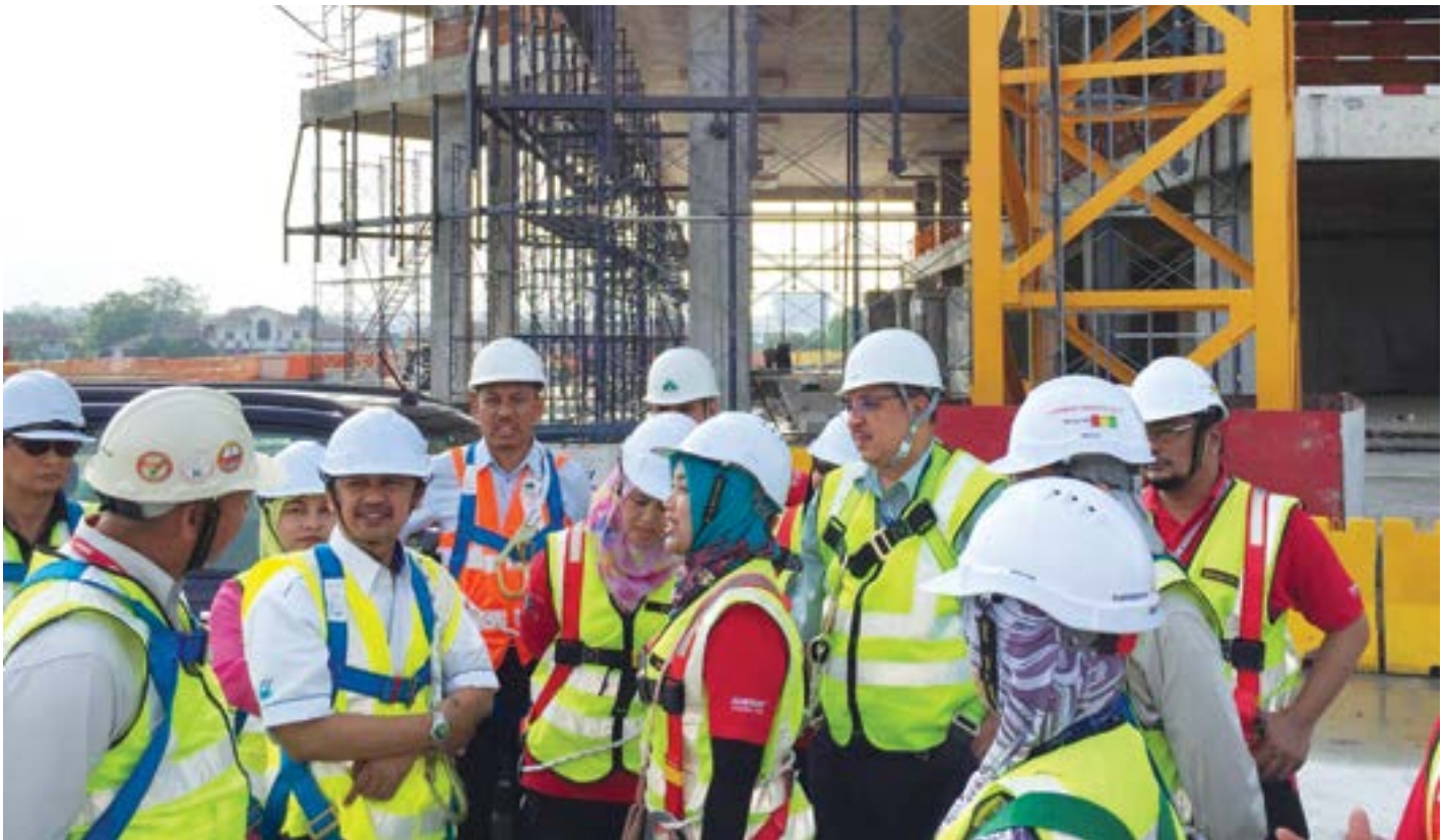
1 Top Management HSE Walkabout at a project site