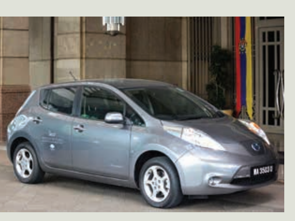
Electric eco-friendly car for MOKL Hotel's in-house guest use

In 2015, our GHG emissions showed a slight improvement under Scope 1 decreasing from 22.30 million tonnes of carbon dioxide equivalent (mt \rm CO_2 -e) in 2014 to 19.45 in 2015. Similarly Scope 2 emissions reduced from 73,201 mt \rm CO_2 -e in 2014 to 67,829 mt \rm CO_2 -e in 2015. This was attributable to the installation of LED lights in the PETRONAS Twin Towers and the basement car park which minimises electricity consumption.