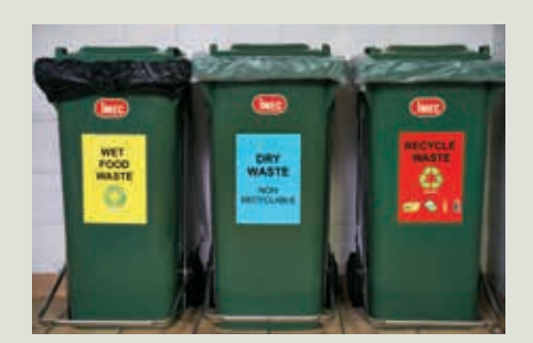
Recycle waste bins at MOKL Hotel

MOKL Hotel diligently tracked its energy usage and reported on a quarterly basis while energy intensity is measured on a monthly basis and compared against targets allocated by Mandarin Oriental Hotel Group. Energy performance is benchmarked against industry standards and internal and external audits are conducted monthly, bi-annually and annually for purposes of continual improvement.