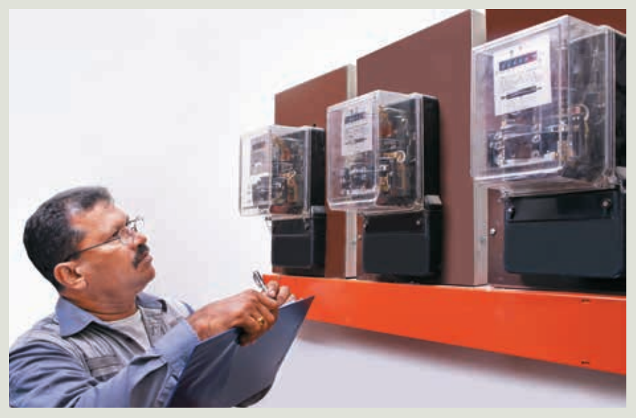
Engineering personnel recording meter reading at MOKL Hotel

Suria KLCC has invested in energy saving lights within the area in the shopping mall since 2008. The photovoltaic system installed on the rooftop of Suria KLCC is capable of producing more than 600 megawatt hours of solar energy annually and continues to conserve the environment for future generations.