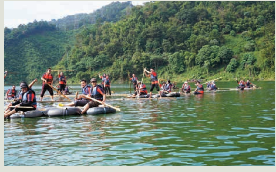
Bamboo rafting at Banding Lakeside in Gerik, Perak

One of the activities held was contributing to the lake ecosystem through fish release program.